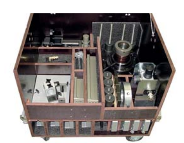
HTS transport container with accessories

The working range of the HTS machine can be increased with additional tools. Slight changes in the working range are possible.