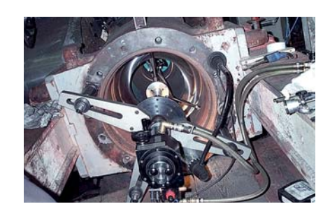
HTS 400 grinding on-site