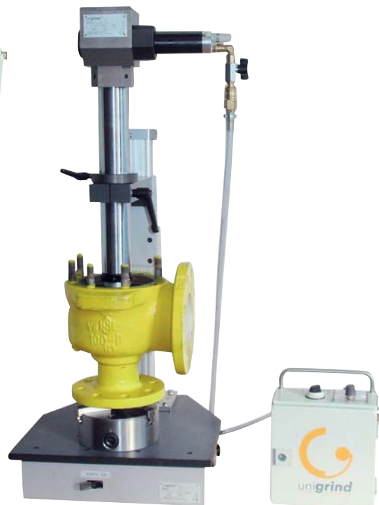
SVS 1 grinding a valve on machine stand