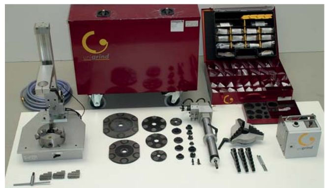
SVS 1 Scope of delivery