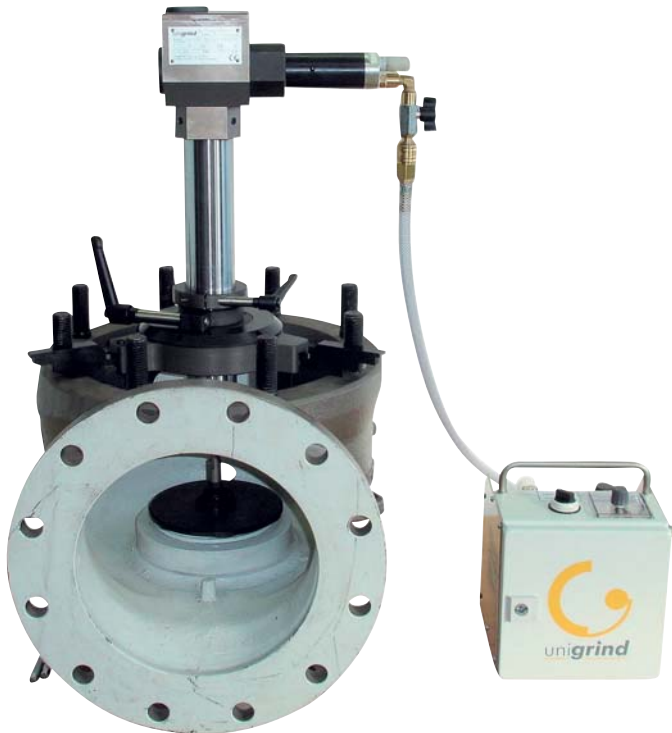
SVS 1 mounted on safety relief valve