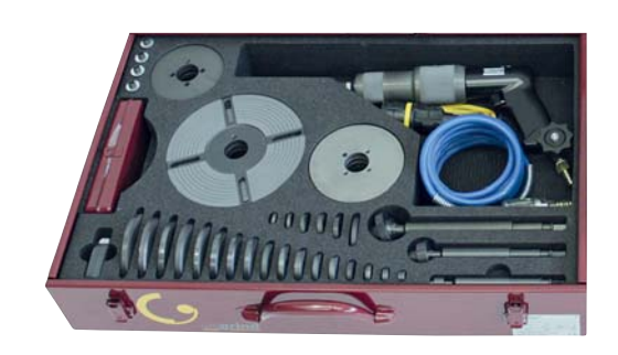
VENTA 150 transport box with grinding tools