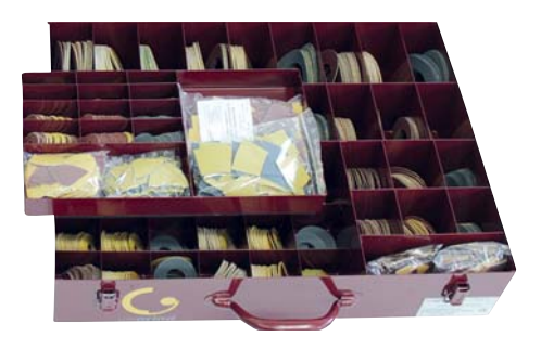
VENTA 150 transport box with abrasive set