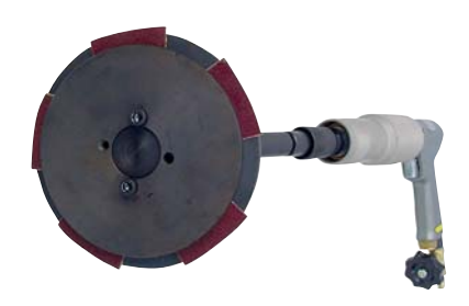
VENTA 150 drive with grinding tools

A large range of self-adhesive rings, disks and segments in quality aluminium oxide, silicon carbide and zirconium oxide available in various grits and DIAPLAN - CBN (= Cubic Boron Nitride) galvanic bonded high performance grinding heads are also available for the planet grinding disks.