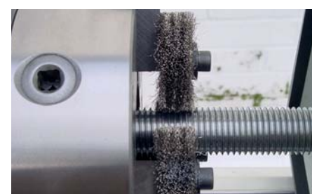
SAM Detail view