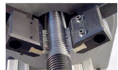
SAM Detail view