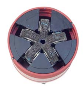
ARG Front view of the cleaning head

Cleaning equipment for female threads to also clean nuts.